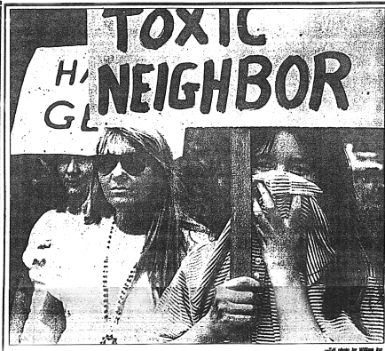
Protesters - Puna residents were in the forefront of the geothermal story this year as many actively opposed development of the industry. Here, three opponents protest the venting of a Puna Geothermal Ventures well in March.