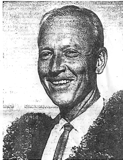
Burns flashes victory smile after Governor Quinn concedes.